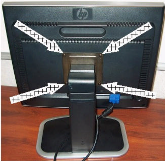
Figure 1a: Stand Mounting Bracket of the L2035 Monitor

PROBLEM DETAILS: Exposed metalwork on some of the L2035 monitors within the serial number range, CNP352xxxx through CNP423xxxx, may not be properly grounded, but instead maybe connected to hazardous voltage. Consequently, an electrical shock could occur upon contact with the stand mounting bracket (Arrowed in Figure 1a) or the monitor base (Arrowed in Figure 1b), or any conductive parts in contact with either of these.