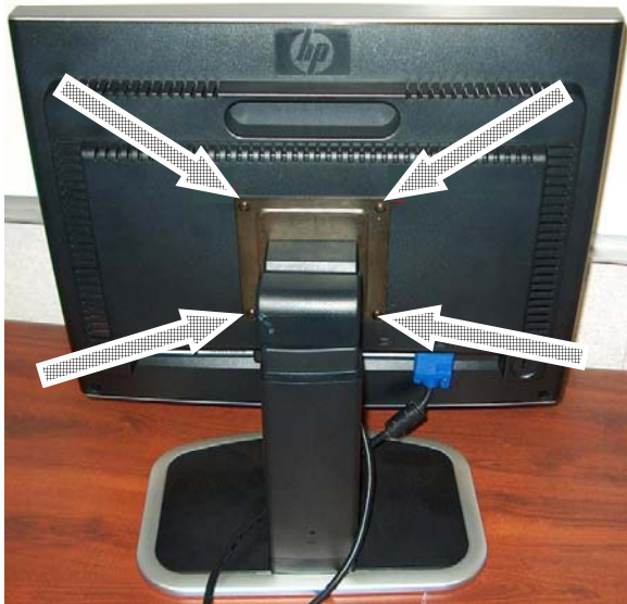
Figure 1a: Stand Mounting Bracket of the L2035 Monitor

PROBLEM DETAILS: Exposed metalwork on some of the L2035 monitors within the serial number range, CNP352xxxx through CNP423xxxx, may not be properly grounded, but instead maybe connected to hazardous voltage. Consequently, an electrical shock could occur upon contact with the stand mounting bracket (Arrowed in Figure 1a) or the monitor base (Arrowed in Figure 1b), or any conductive parts in contact with either of these.